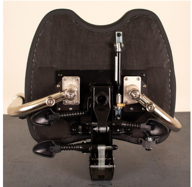
Fig. 2 – Attaching Chair Arm Assembly