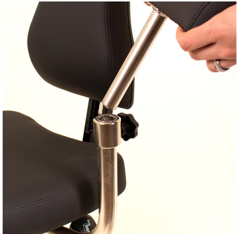
Fig. 3 – Inserting Chair Arm Post with Pad