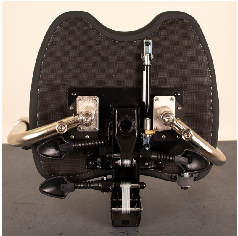
Fig. 2 – Attaching Chair Arm Assembly